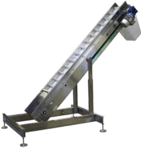
*Shown with optional stand, motor and custom chute.