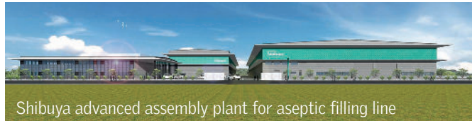
Shibuya advanced assembly plant for aseptic filling line