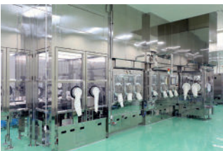
Aseptic/hazardous filling system for anti-cancer drug

Established in 1931, Shibuya Corporation is a leading supplier of bottling and packaging systems that are tried and trusted by clients in the beverage, food, cosmetics, semiconductor, agriculture and healthcare industries. The Japanese firm started out supplying its bottling systems to a sake brewing company and later expanded its activities in the bottling business, including the manufacture of bottle washers, fillers, cappers, labelers, case packers, palletizers, and the world's first system that could handle a wide variety of containers, from 180ml to 1800ml, on a single machine in the early 1960s.