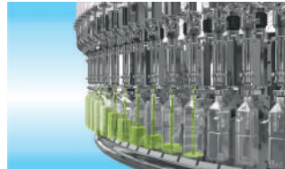
Aseptic PET filling system for beverage and dairy products

vision to expand this core technology to new markets worldwide," reveals the president. "We are now making new developments with several business partners in areas such as aseptic processing, which is used for our bottling and pharmaceutical systems. Through collaborative synergies among Shibuya group companies, we have the potential to expand our business in the fields of regenerative medicine, semiconductors, food processing and pharmaceuticals."