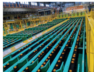
Grading & sorting system for agricultural products